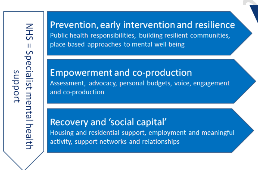
Figure 1: Rebalancing the system in favour of prevention, early intervention, empowerment and recovery

We will recognise the contribution made by families and carers, and the need – highlighted in the Care Act 2014 – to provide support for carers and families in their own right as well as to enable them to better support their loved ones.